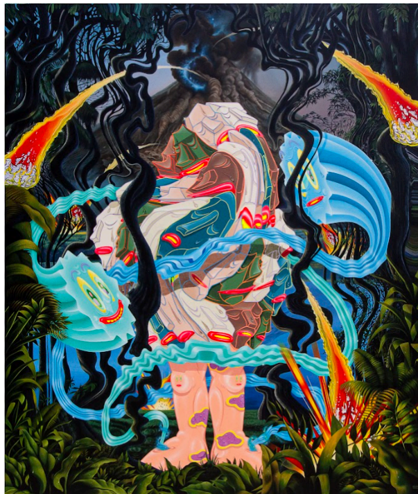
Uji “Hahan” Handoko Eko Saputro, Public Sentiment, Planted and Harvested Daily 2026, Acrylic on Canvas, 190 x 160 cm

More high-res images available here , image credits to Gajah Gallery For images, interviews and other media enquiries, contact art@gajahgallery.com