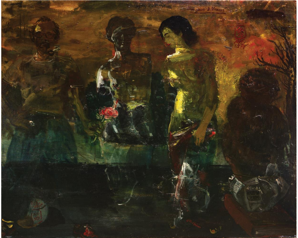
S. Sudjojono, Me & Three Venueses, 1974, Oil on Canvas, 80 x 100 cm