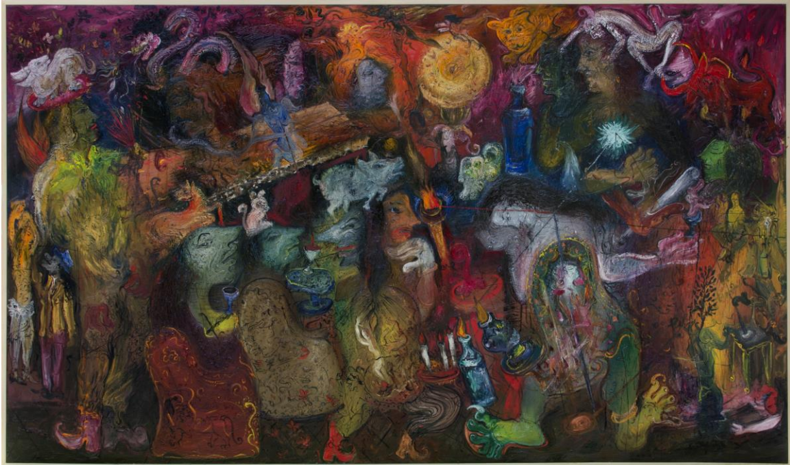
Nasirun, Untitled, 2013, Oil on Canvas, 250 x 145 cm