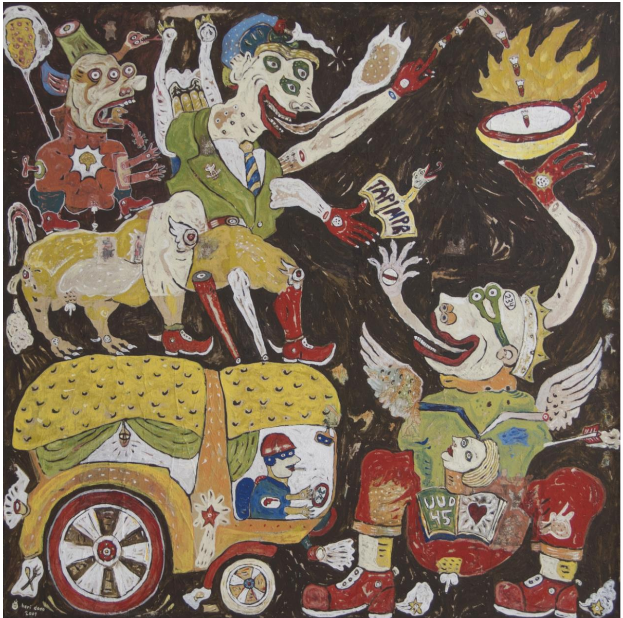
Henri Dono, Political Acrobat, 2001, Mixed Media on Chavas, 150 x 150 cm