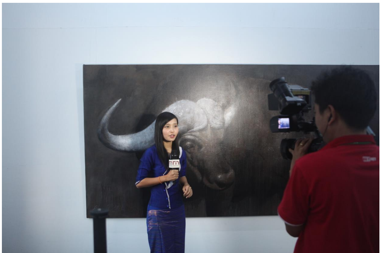
Exhibition Opening in Yangon (22 nd Oct 2013)