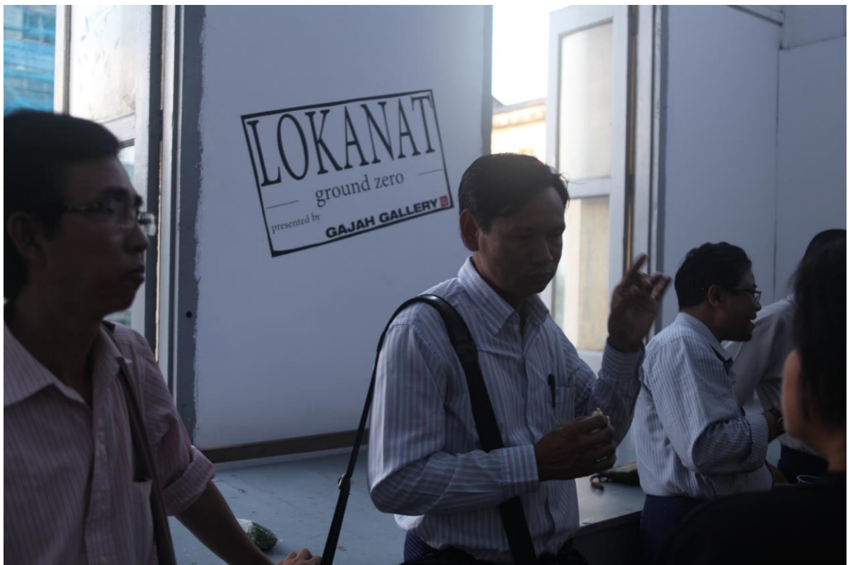
Exhibition Opening in Yangon (22 nd Oct 2013)