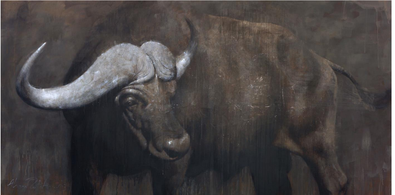
Ahmad Zakii Anwar, Bull, 2013, 137 x 274 cm, Acrylic on canvas