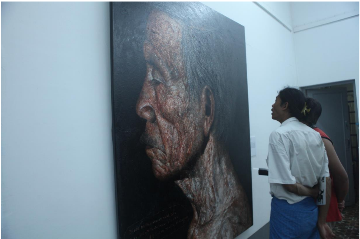
Exhibition Opening in Yangon (22 nd Oct 2013)