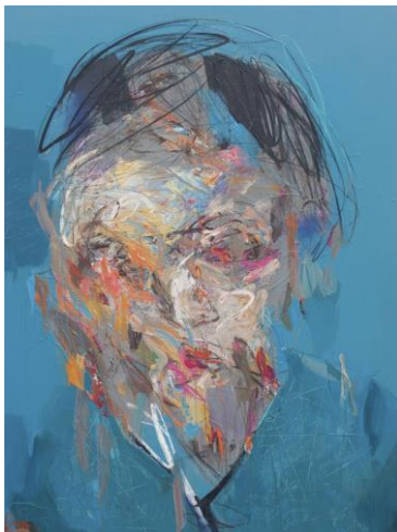
Erizal As, 2015 Faceless Series , acrylic on canvas 200 x 150 cm