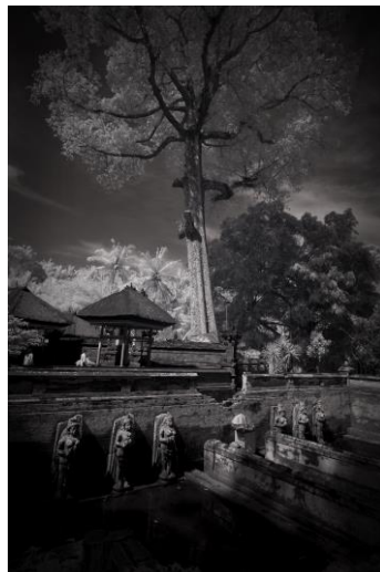
Risman Marah, 2016 Negeri Seribu Dewa , photo print on canvas 150 x 105 cm