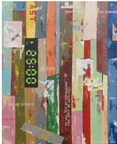
Riri Suheri, 2016 Extra Time , acrylic and rubber on canvas 180 x 150 cm