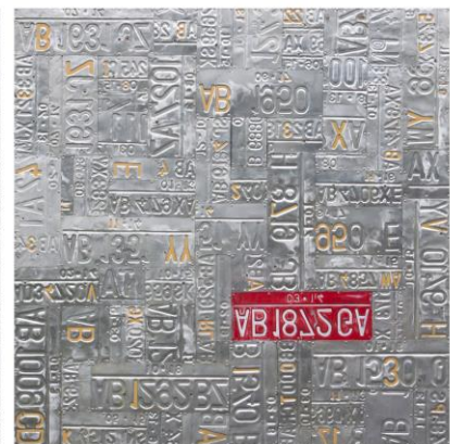
Dery Pratama, 2016, Deboss Series Identity , aluminum plate, 122 x 122cm each (3 plates)