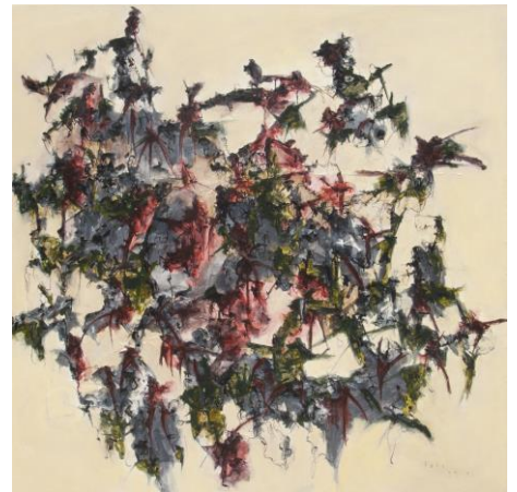
Loli Rusman, 2015 Rainbow Jasmine , acrylic on canvas 150 x 150 cm