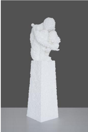
Afdhal, 2016 Menatap Putih , sponge and silicon rubber 150 x 50 x 50 cm