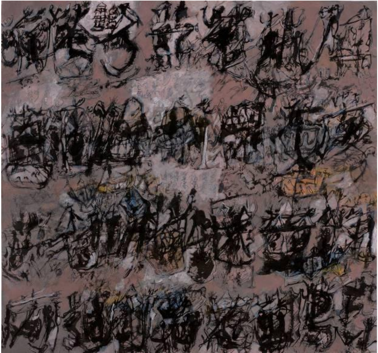
烟村 (Smoke Village), 2017 Acrylic and Ink on Xuan Paper 90 x 97cm