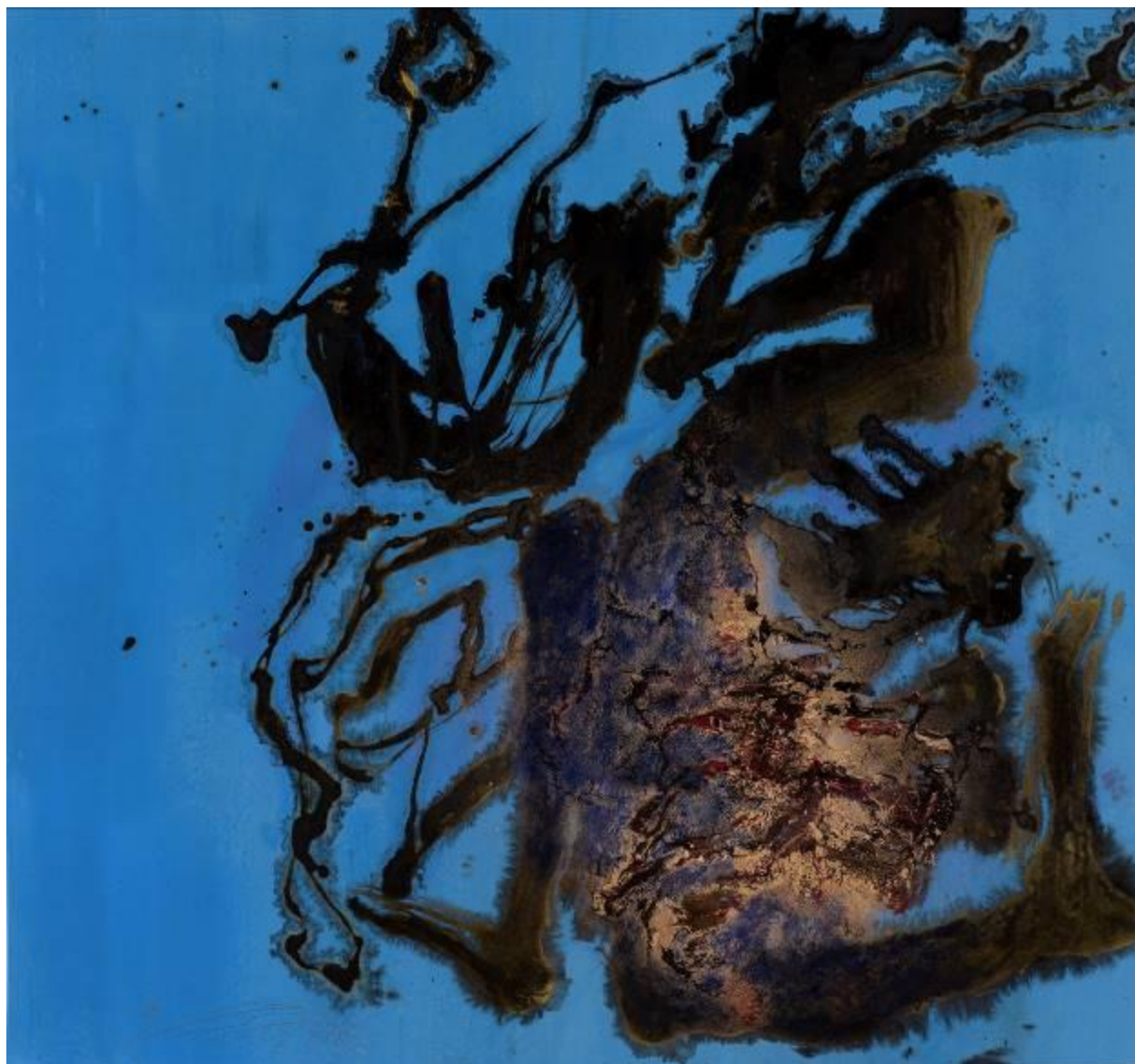
龙 (Dragon), 2017 Acrylic and Ink on Xuan Paper 90 x 97cm