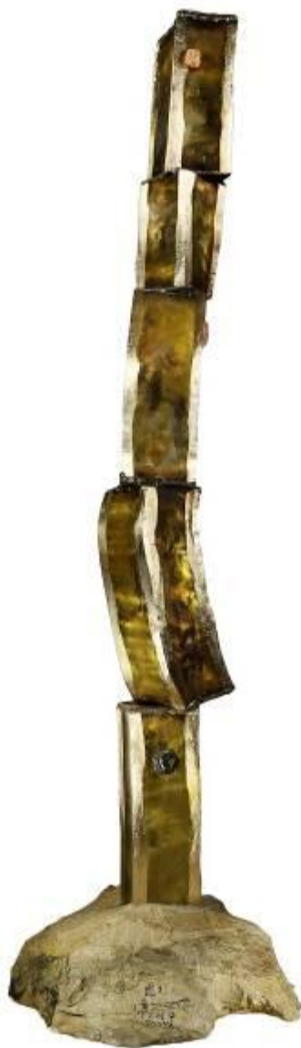
道 2 one for all 2 ( 大道歸 | one for all) 2, 2017