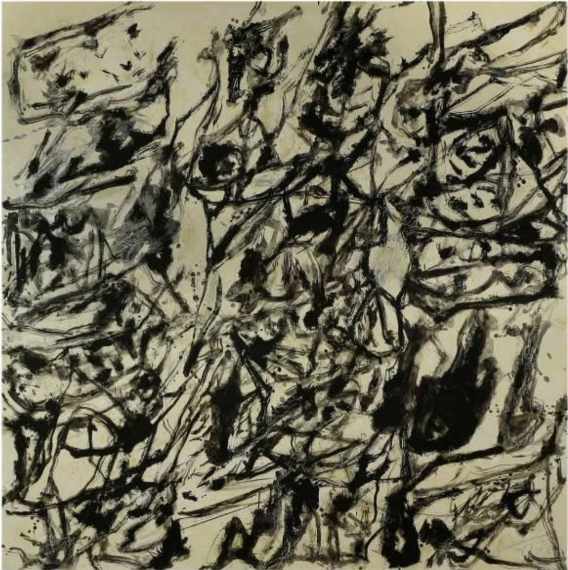
Merapi 印象 The Impression of Merapi, 2017 Chinese Ink, Oil Paint on Canvas 200 x 199cm