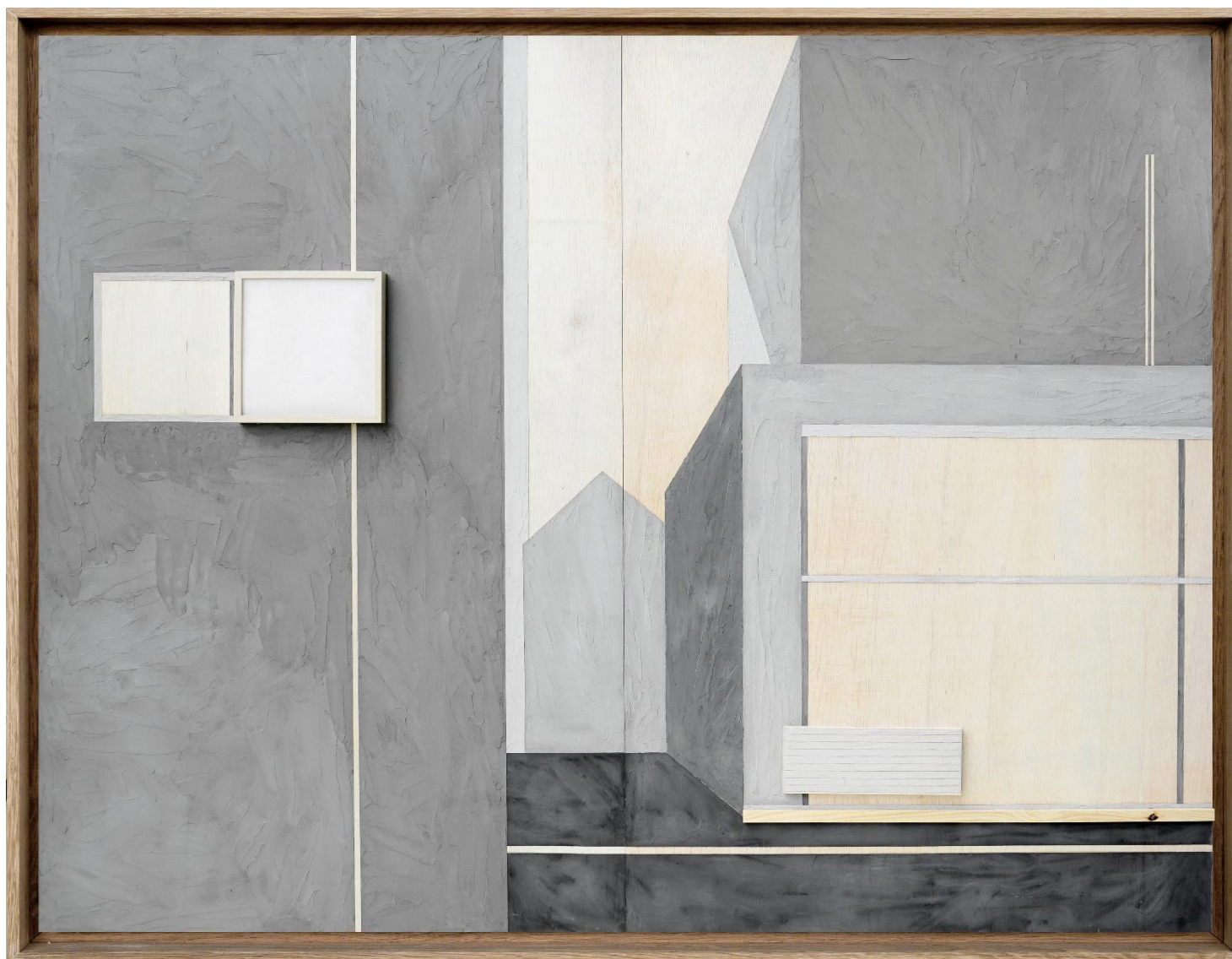
Kayleigh Goh, Replaying Days in the Lullaby I, 2018, Window Screen, Cement & Acrylic Paint on Wood, 200 x 150 x 5 cm