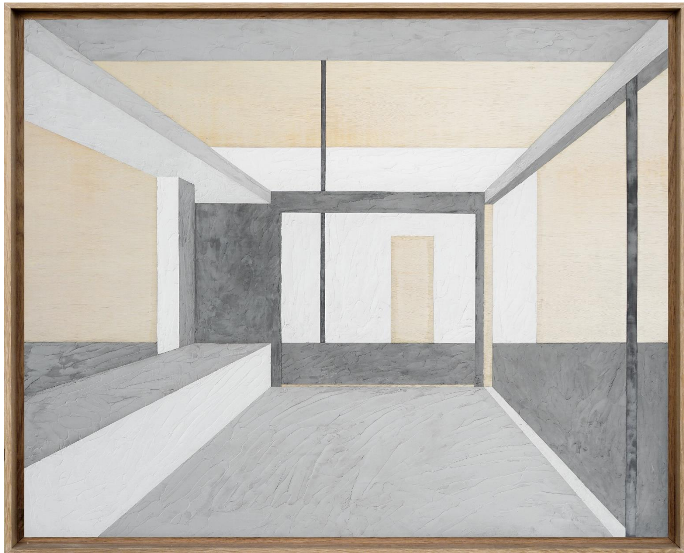
Kayleigh Goh, Sunlight after Hours of Greys, 2018, 150cm x 120cm, Cement _ Acrylic Paint on Wood