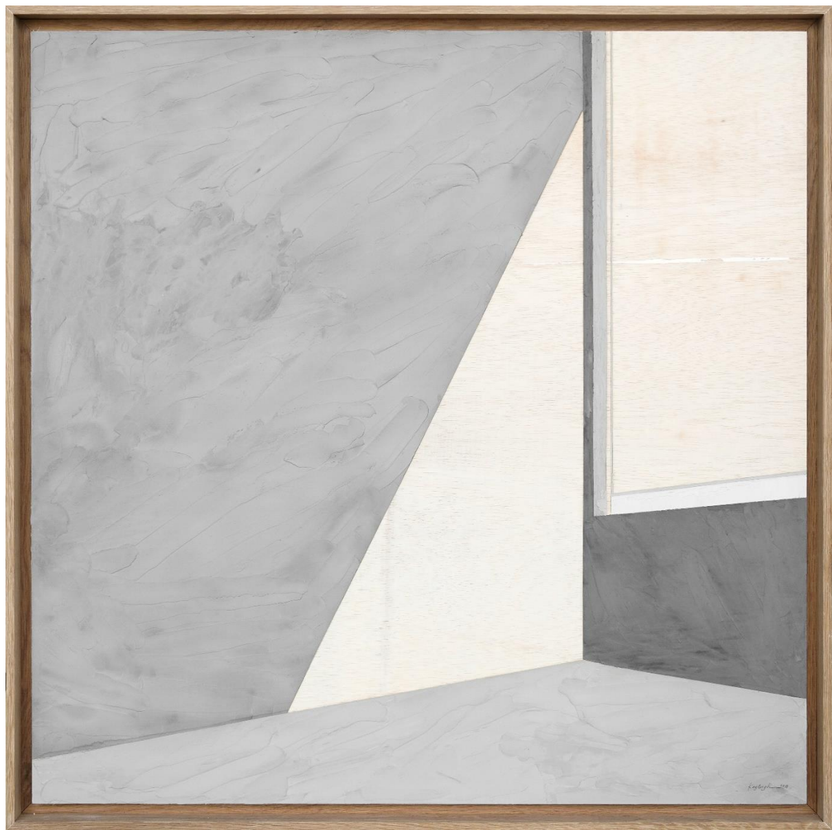
Kayleigh Goh, Breath, 2018, Cement & Acrylic Paint on Wood, 80 x 80 cm