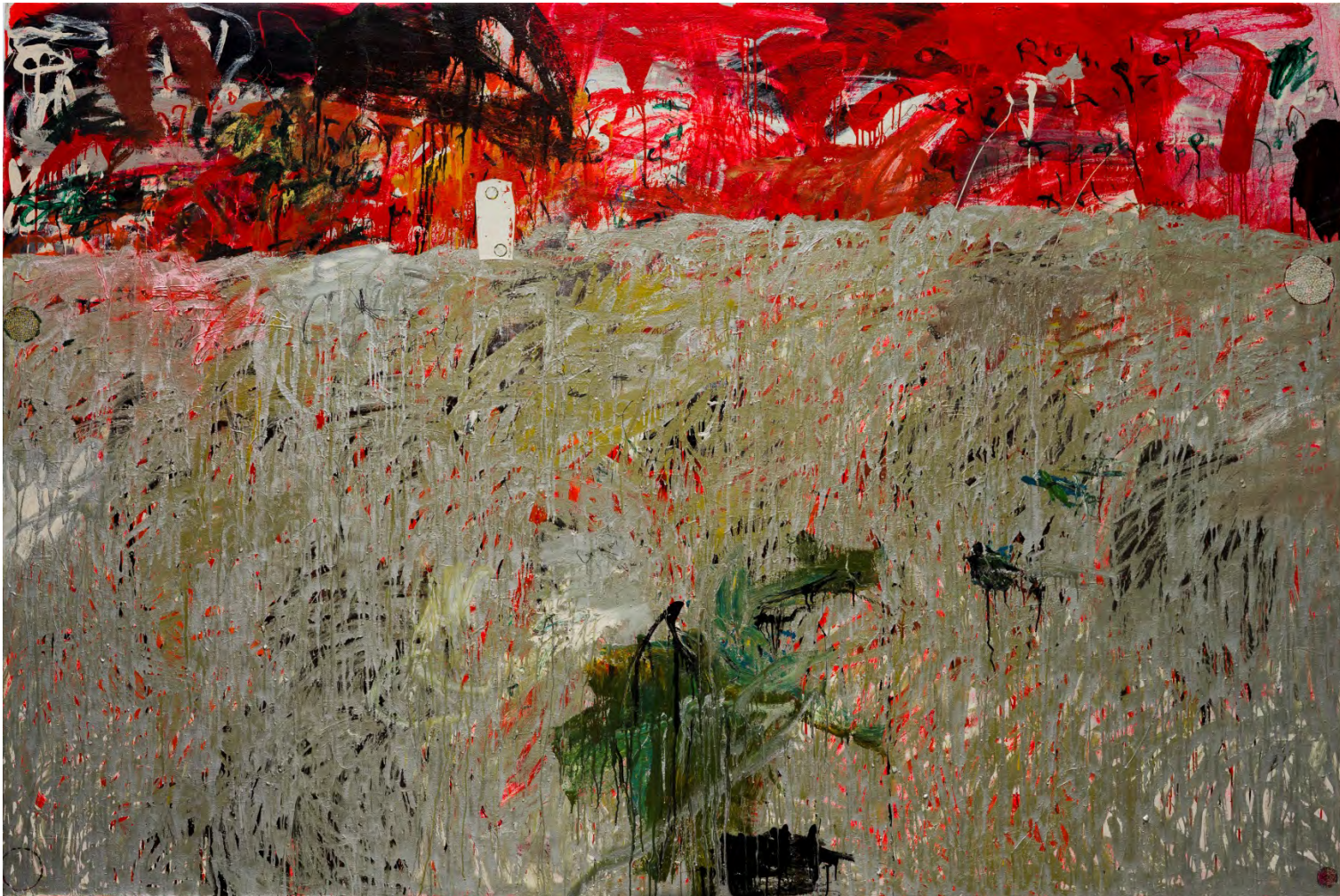
Ibrahim Untitled 2012 Acrylic pencil on canvas 200 x 300 cm