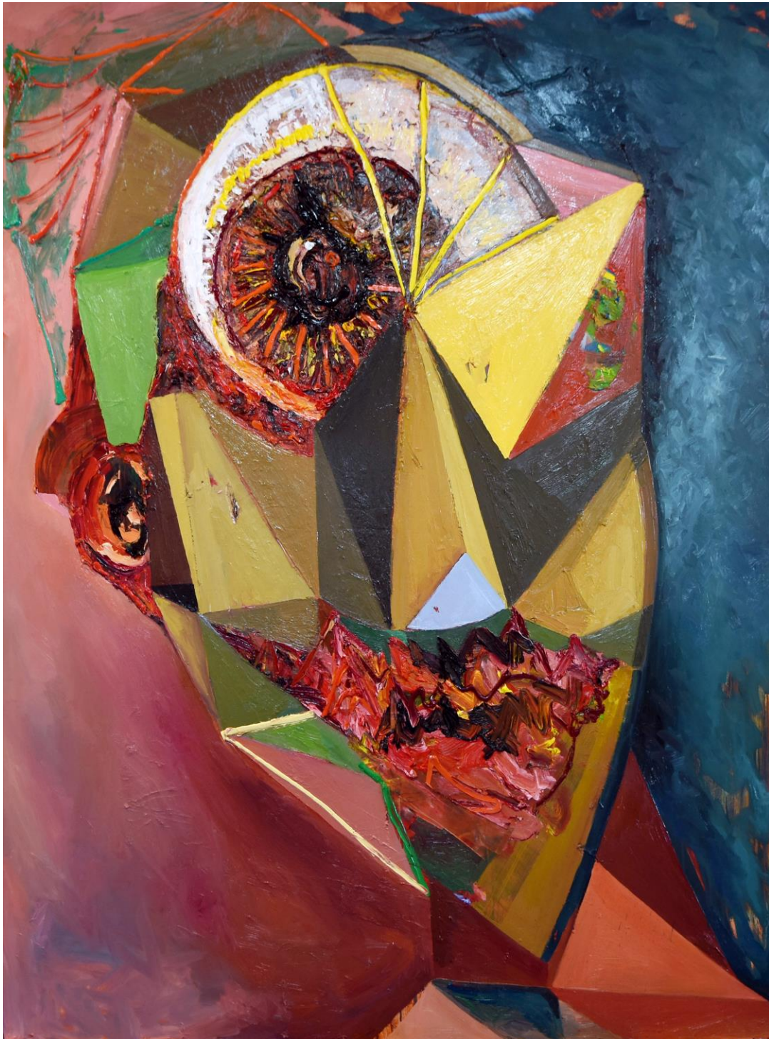
Gerald Tay, Daybreak Nightmare, 2018, Oil on Canvas, 203 x 152 cm