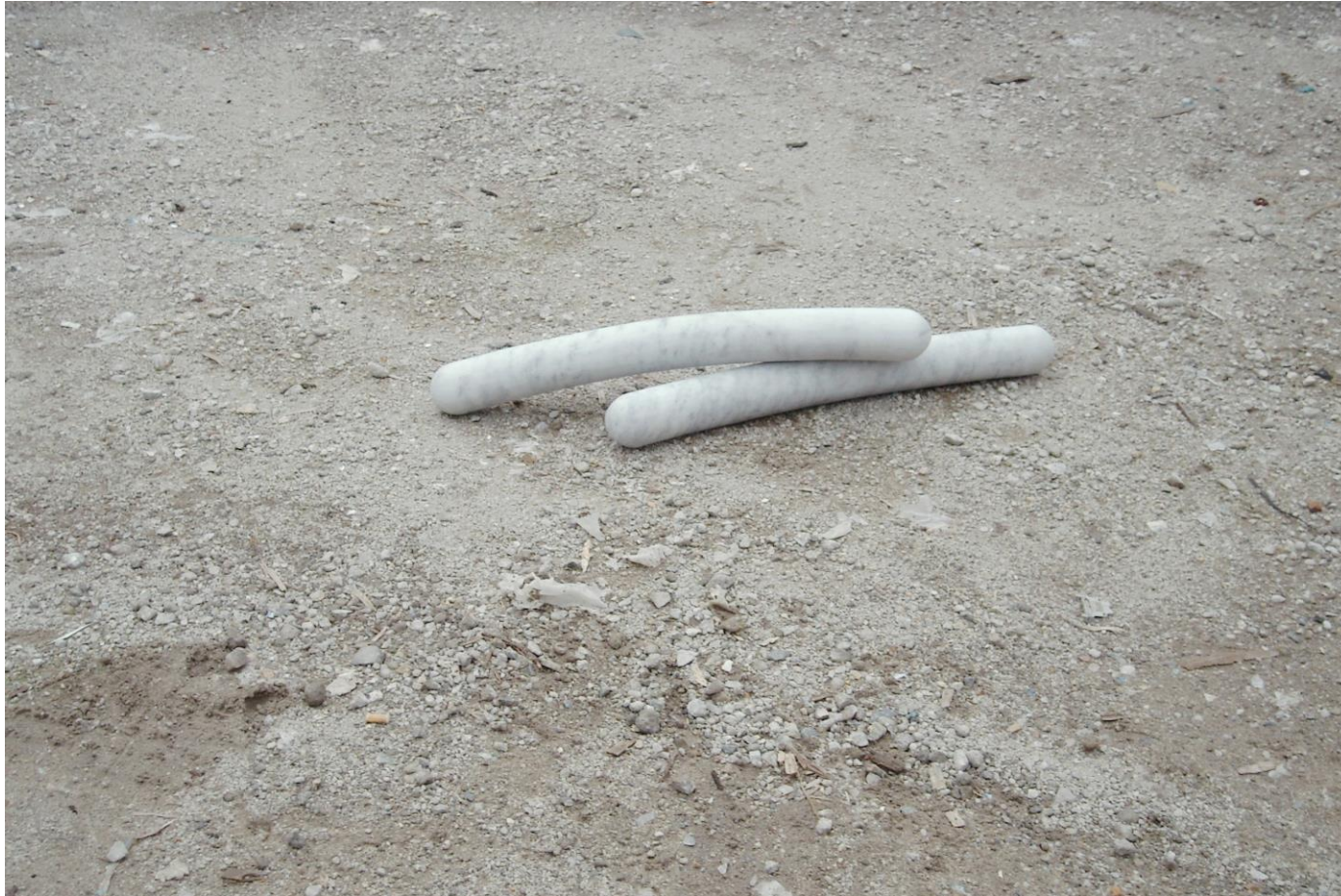
Ong Si Hui, Lean, 2018, Marble (Bianco Carrara), Dimensions Variable (Each 7 x 10 x 66.5 cm)