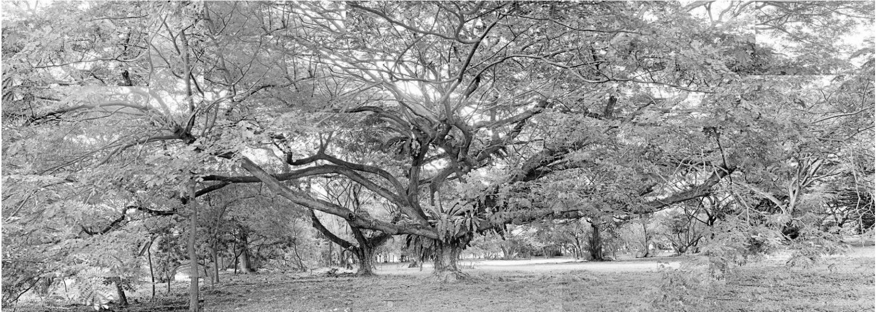
Tan Shao Qi, Hidden Wilderness, 2018, Film Photography on Matt Cotton Paper, 200 x 71 cm