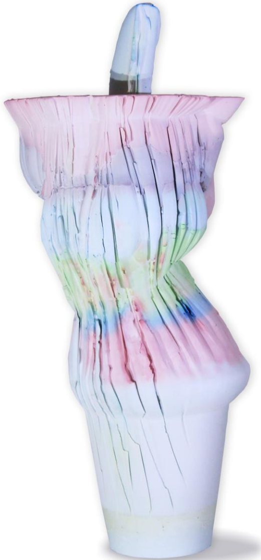
Masuri Mazlan, Sublime Surmise, 2018, Plaster and Food Coloring, 64.3 x 27.4 x 28.5 cm