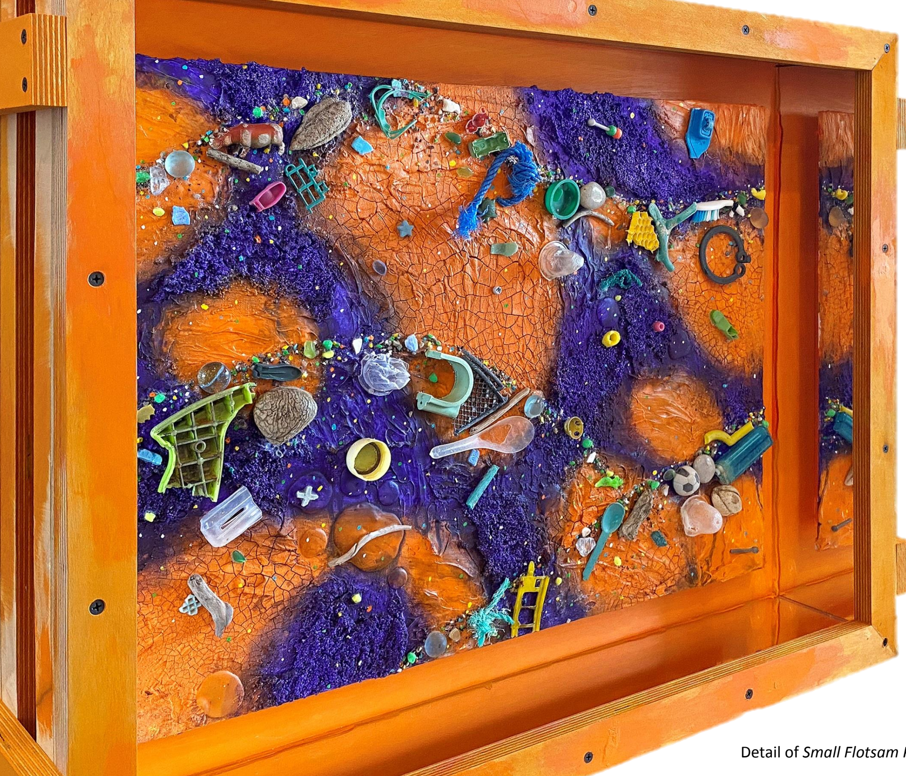
Detail of Small Flotsam Painting (Orange/Purple)