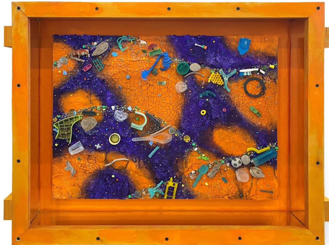
Ashley Bickerton Small Flotsam Painting (Orange/Purple) , 2020 Acrylic and Found Beach Flotsam on Canvas Board with Artist Made Plywood Construction 59.7 x 78.7 x 14 cm