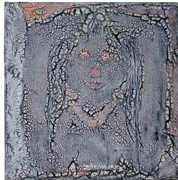
I Made Djrna Dirumah Saja (Stay Home) 2020 Mix media on canvas 45 x 45 cm x 3 panels