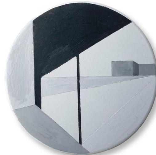
Kayleigh Goh Beneath the Lights 02, 03, 04 2020 Paint on ceramic 10cm diameter each