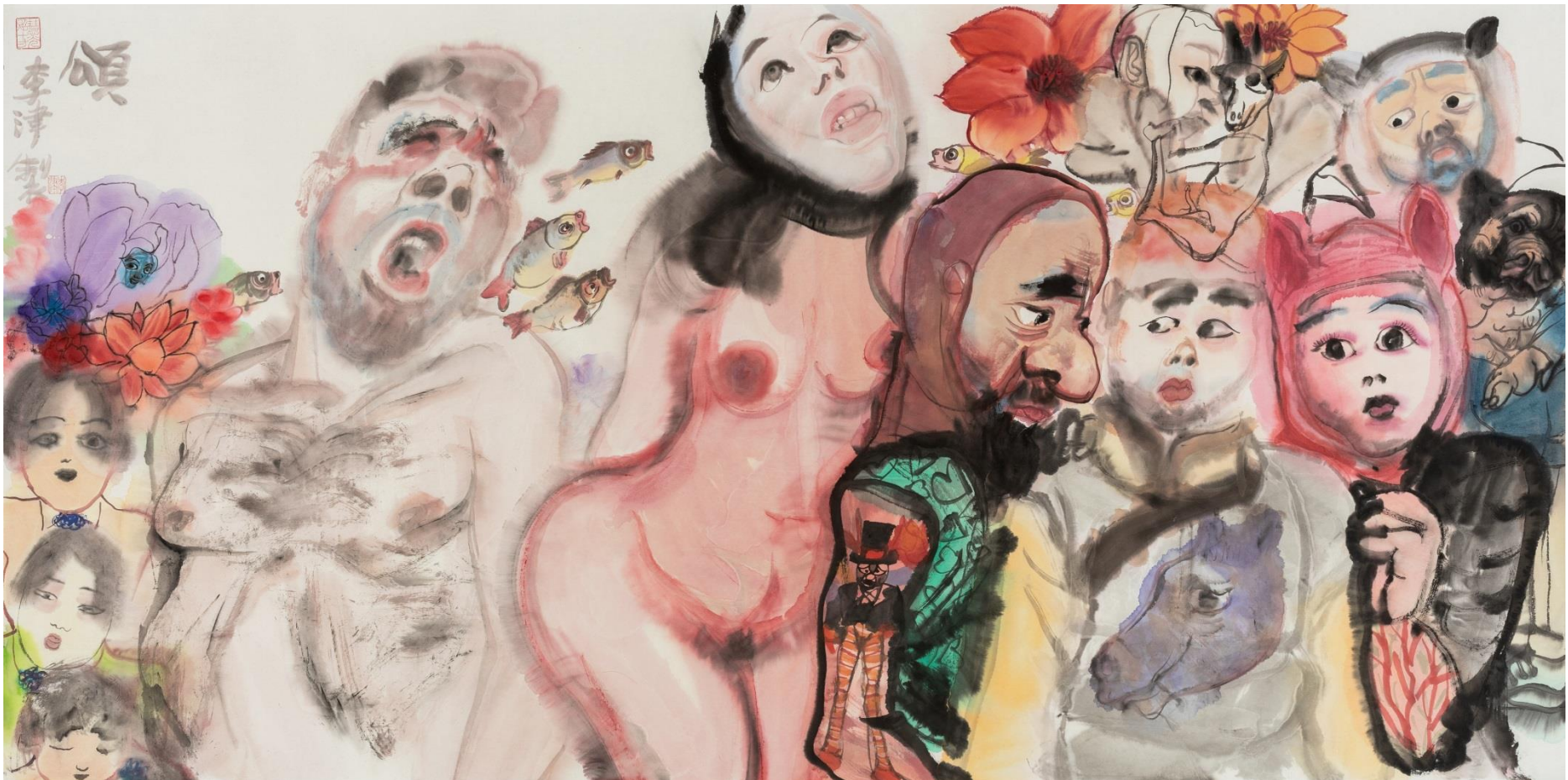
Li Jin 颂 2019 Ink on paper 65 x 137 cm