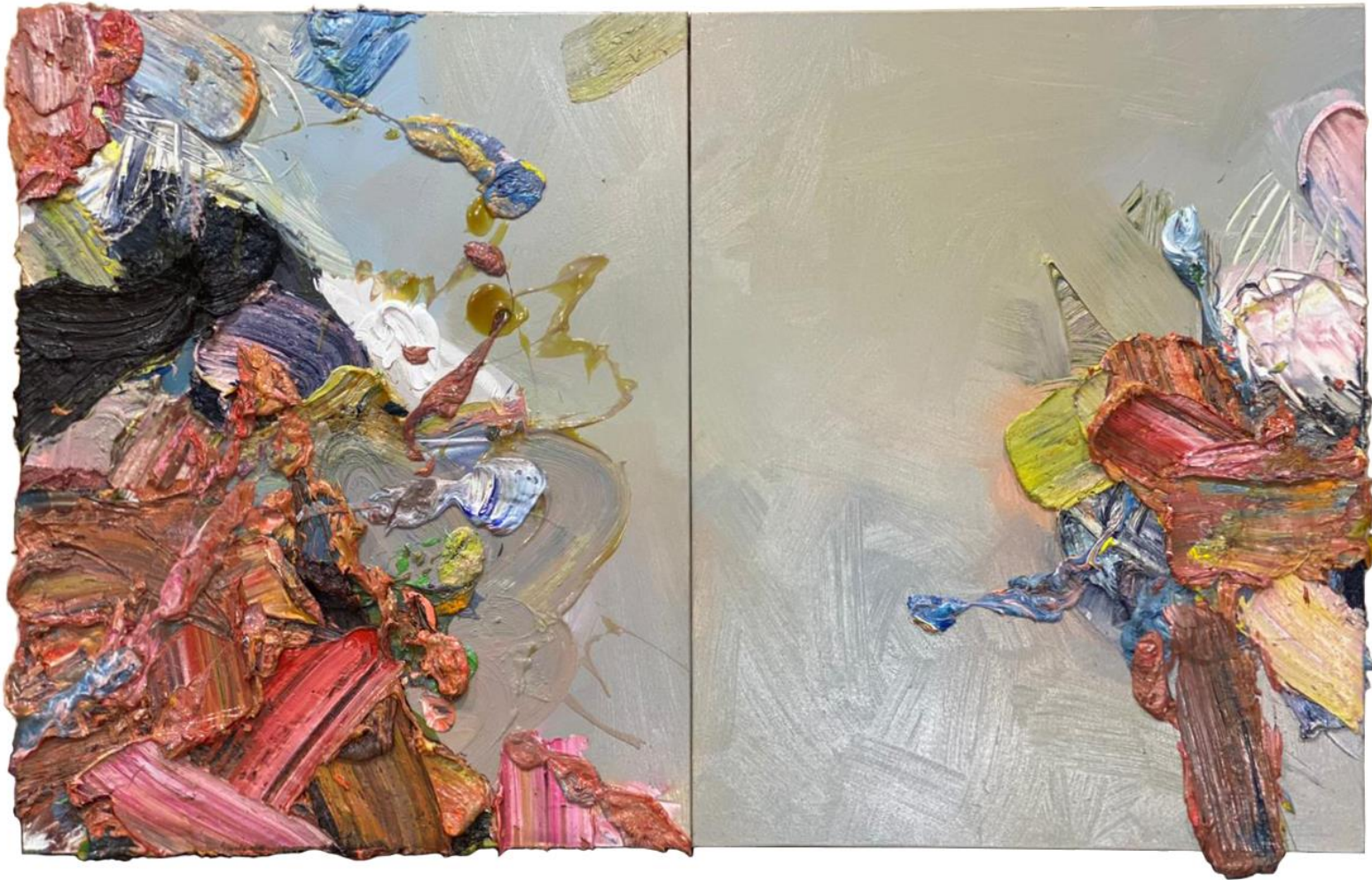
Erizal As Physical Distance (Jarak) , 2020 oil on canvas, 100 x 160 cm