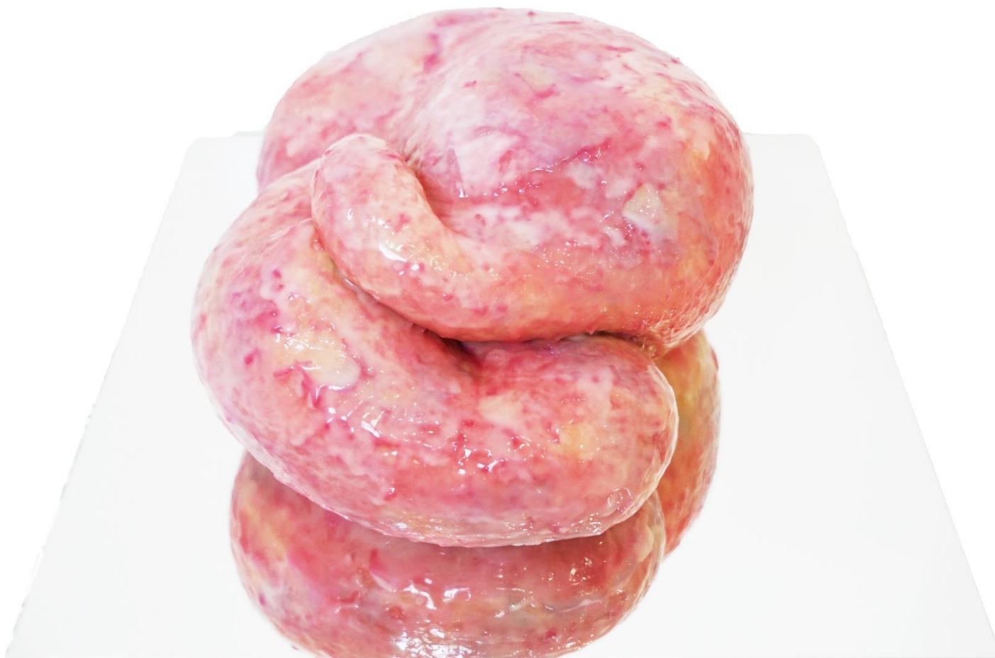
Kara Inez, Bunny , 2019, silicone, rice and stockings, 24.5 x 20 x 11 cm