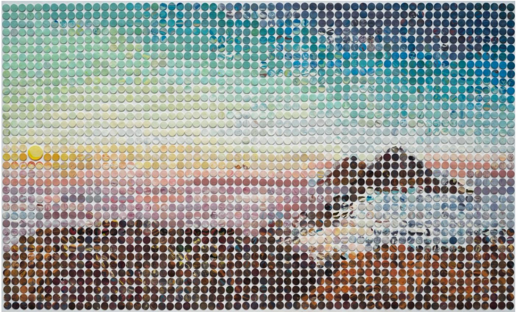
Dini Nur Aghnia, Sunrise at Prau , 2018, flour clay on canvas board, 200 x 120 cm