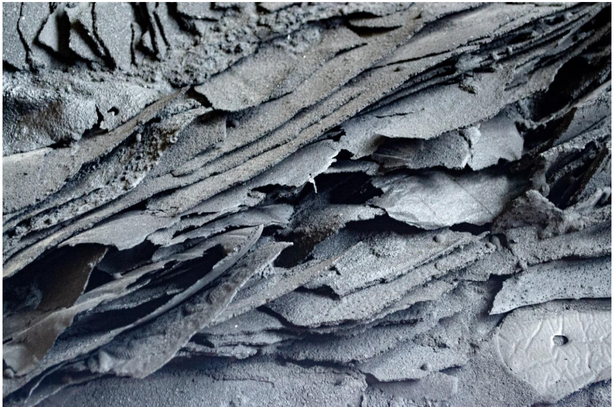
Detail of work