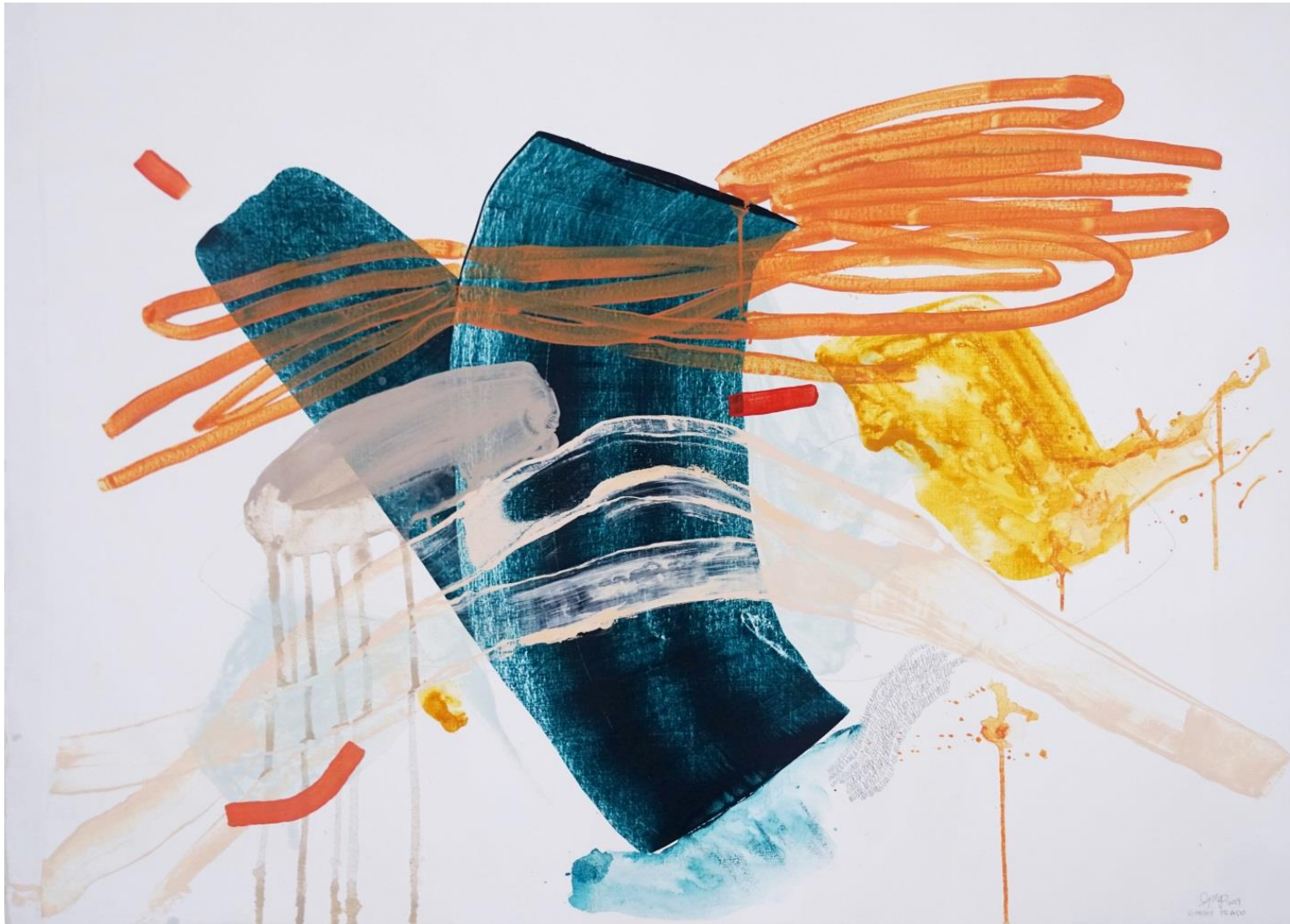
Gabby Prado, Rare Meeting in the Mountain , 2019, acrylic and pencil on canvas, 92 x 122 cm