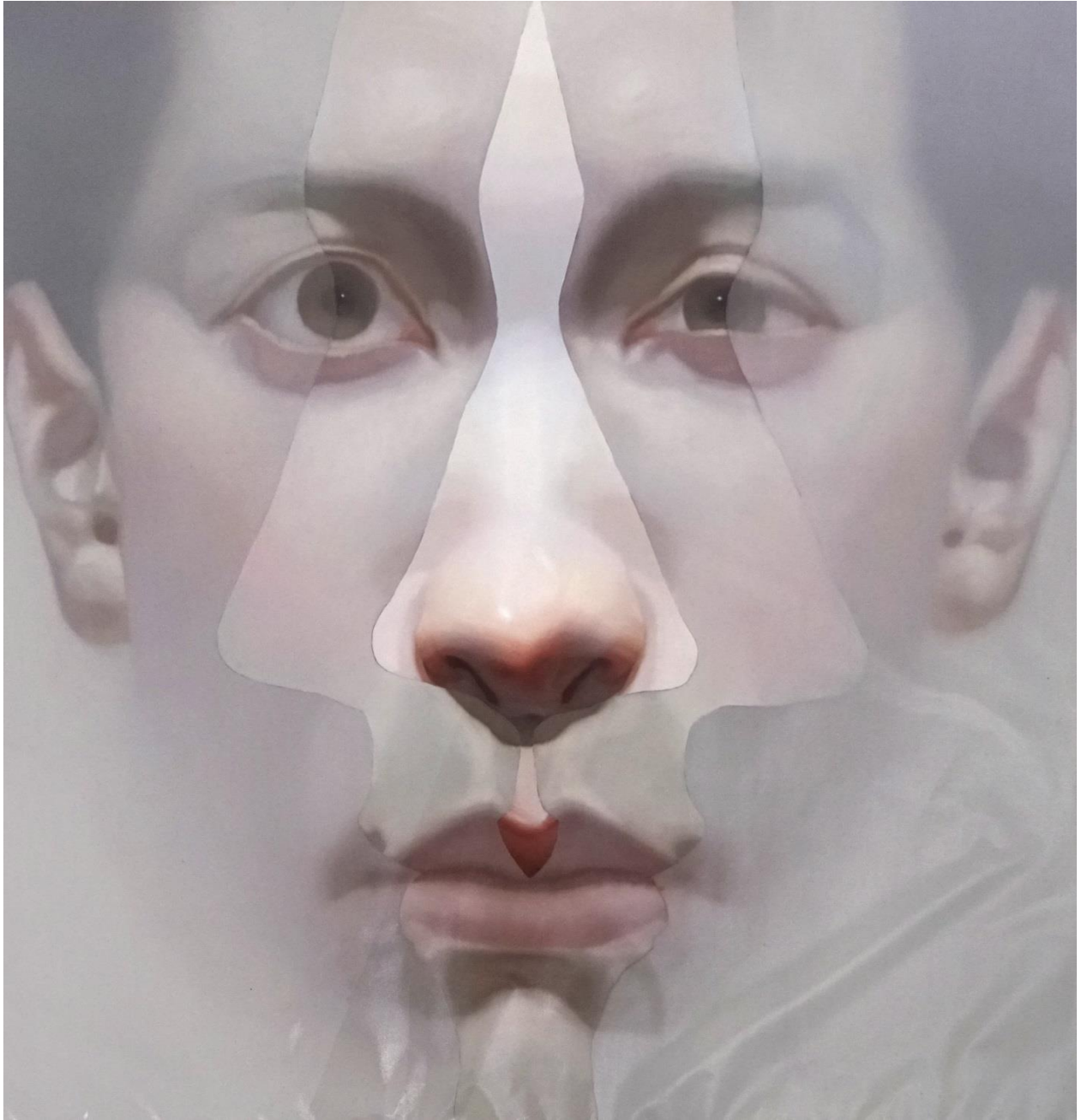
Napanat Gler Tae In My Mind , 2019 Acrylic on canvas, 200 x 200 cm