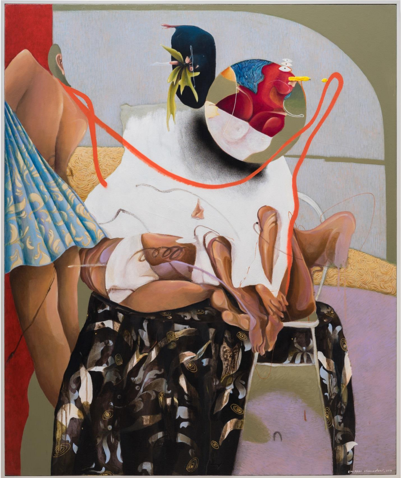
Enggar Rhomadioni, The Value of Dress and Body Shape , 2019 Acrylic, décor paint, spray paint on canvas, 120 x 100 cm