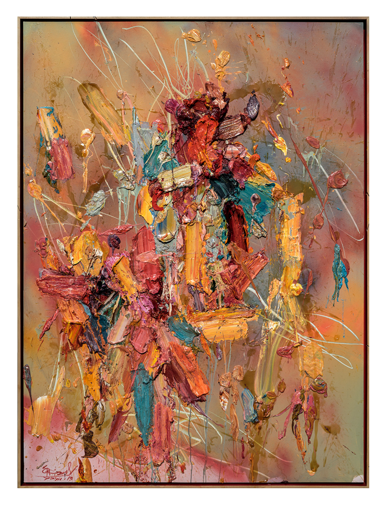
Suara Tak Berbunyi (Voice with no Sound), 2019, oil and acrylic on canvas, 230 x 170 cm