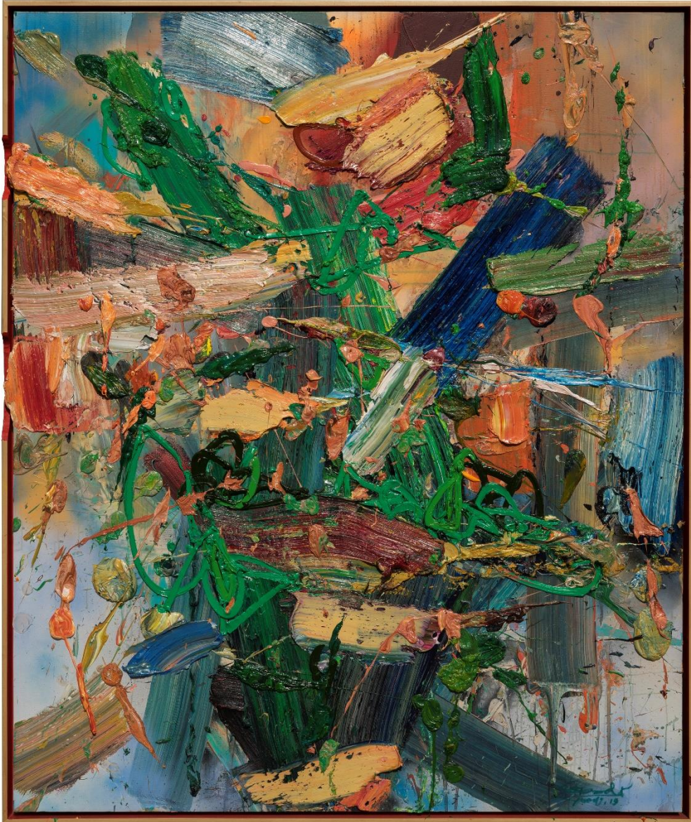
Untitled , 2019, acrylic and oil on canvas, 200 x 170 cm