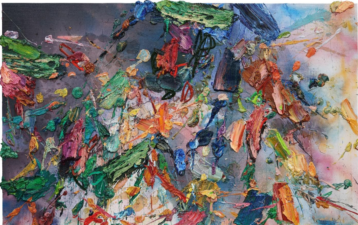
Tolerance and Intolerance , 2019, acrylic and oil on canvas, 195 x 305 cm

Open to Public | 26 July – 31 August 2019