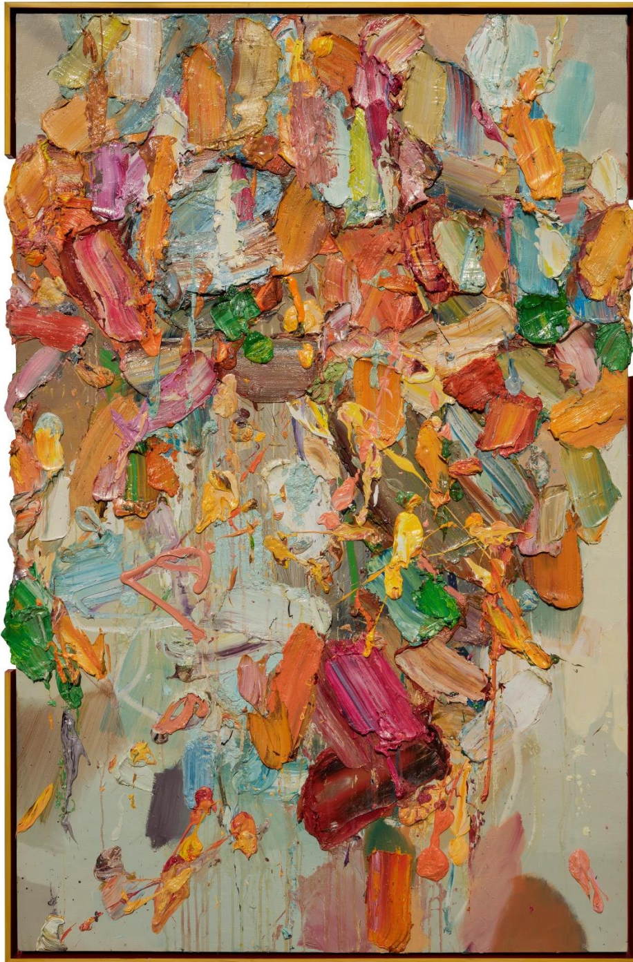
Untitled , 2019, oil on canvas, 230 x 170 cm