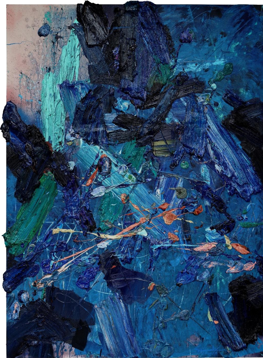
Untitled , 2019, acrylic and oil on canvas, 230 x 170 cm