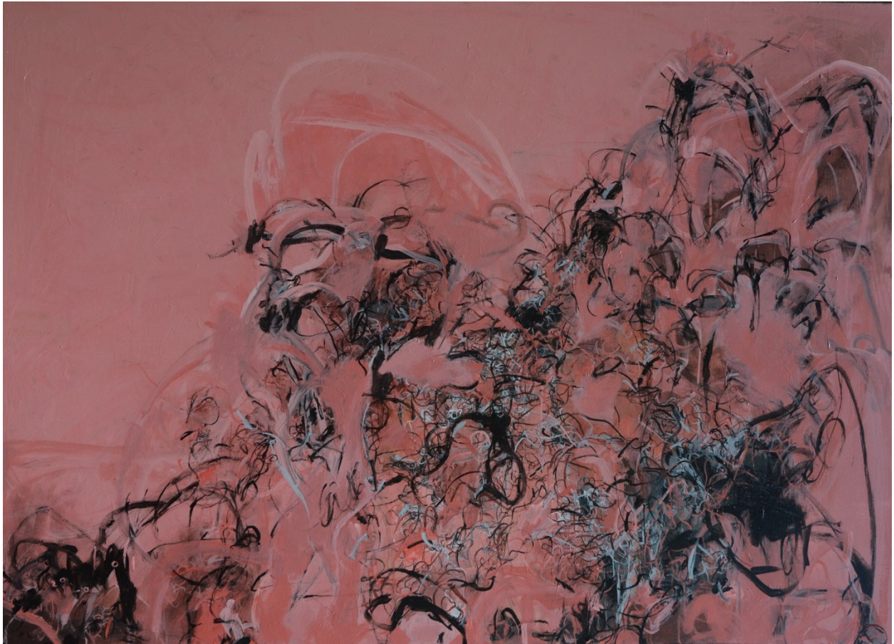
Persembahan Untuk Rohana Kudus 1, 2020