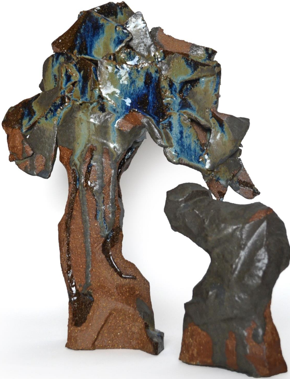
Full Blossom, 2019

Terracotta crank clay, 34 x 16 x 50cm (Tree- 24 x 9 x 35cm, Man- 10 x 7 x 15cm)