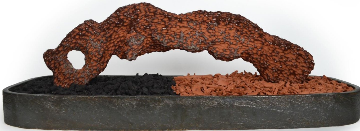
Sunrise and Sunset, 2019 Terracotta crank clay, 64 x 24 x 21cm