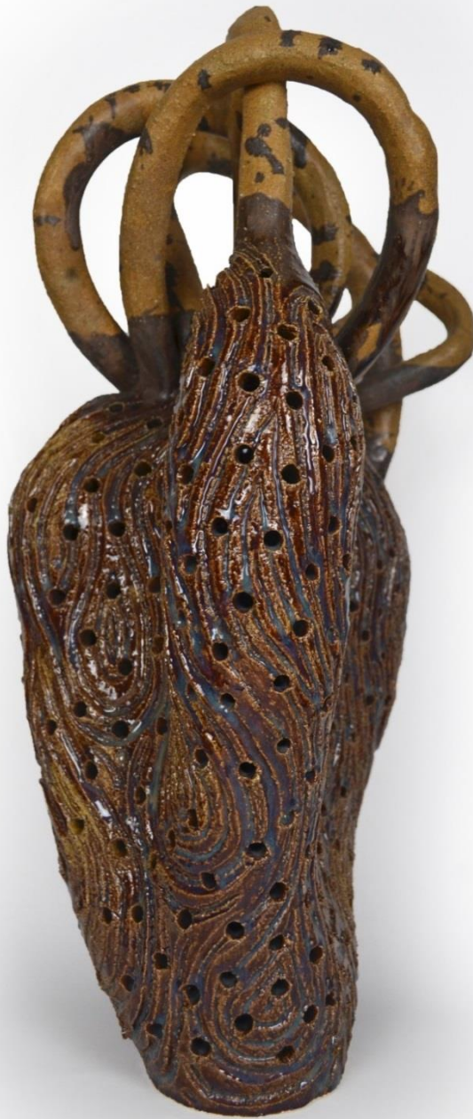
Heartstone 2, 2018 Glazed stoneware, 23 x 25 x 54cm