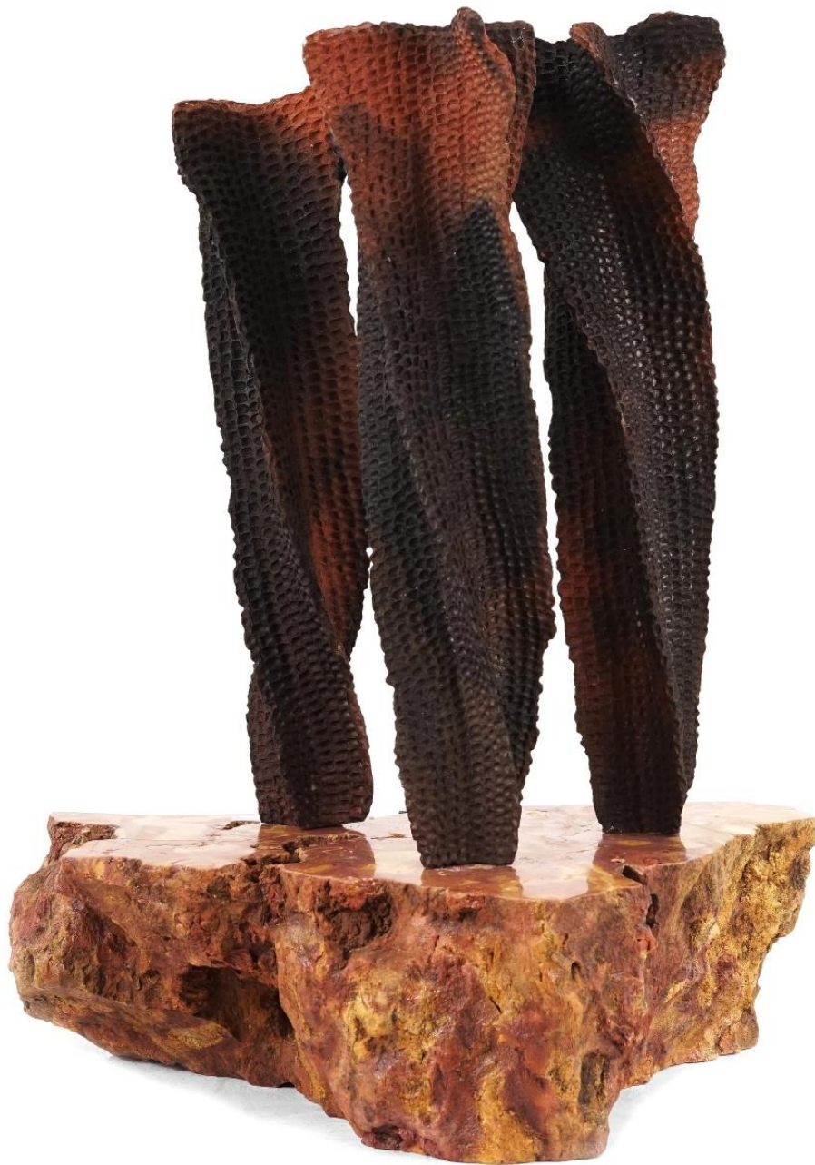
Reflecting Light with Dark Mirror, 2019 Earthenware and marble stone, 55 x 62 x 72 cm