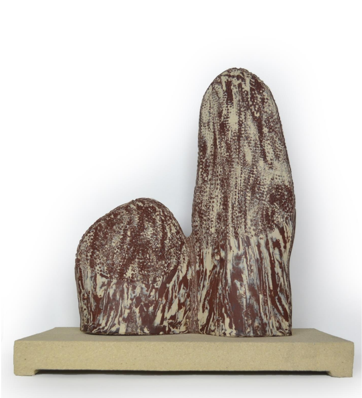
Beyond the Clouds 2 , 2019 Terracotta and white stoneware, 33 x 7 x 40cm (Base - 44.5 x 21 x 4.5cm)