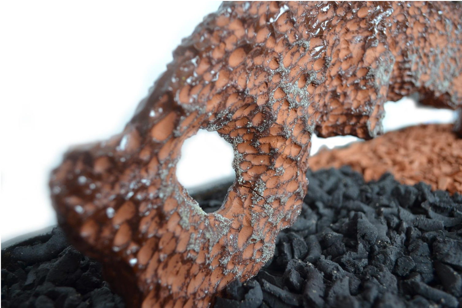
Detail of Sunrise and Sunset