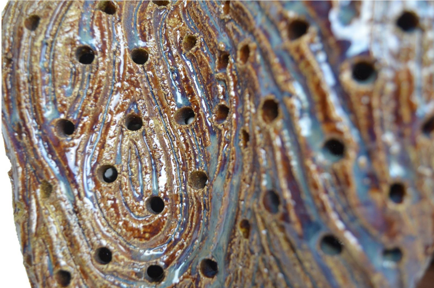
Detail of Heartstone 2