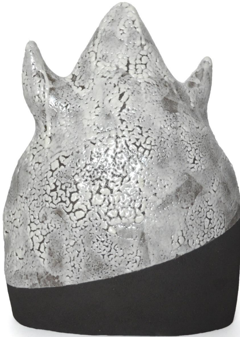
Beyond the Clouds 3 , 2019 Glazed black clay, 20 x 10 x 31cm