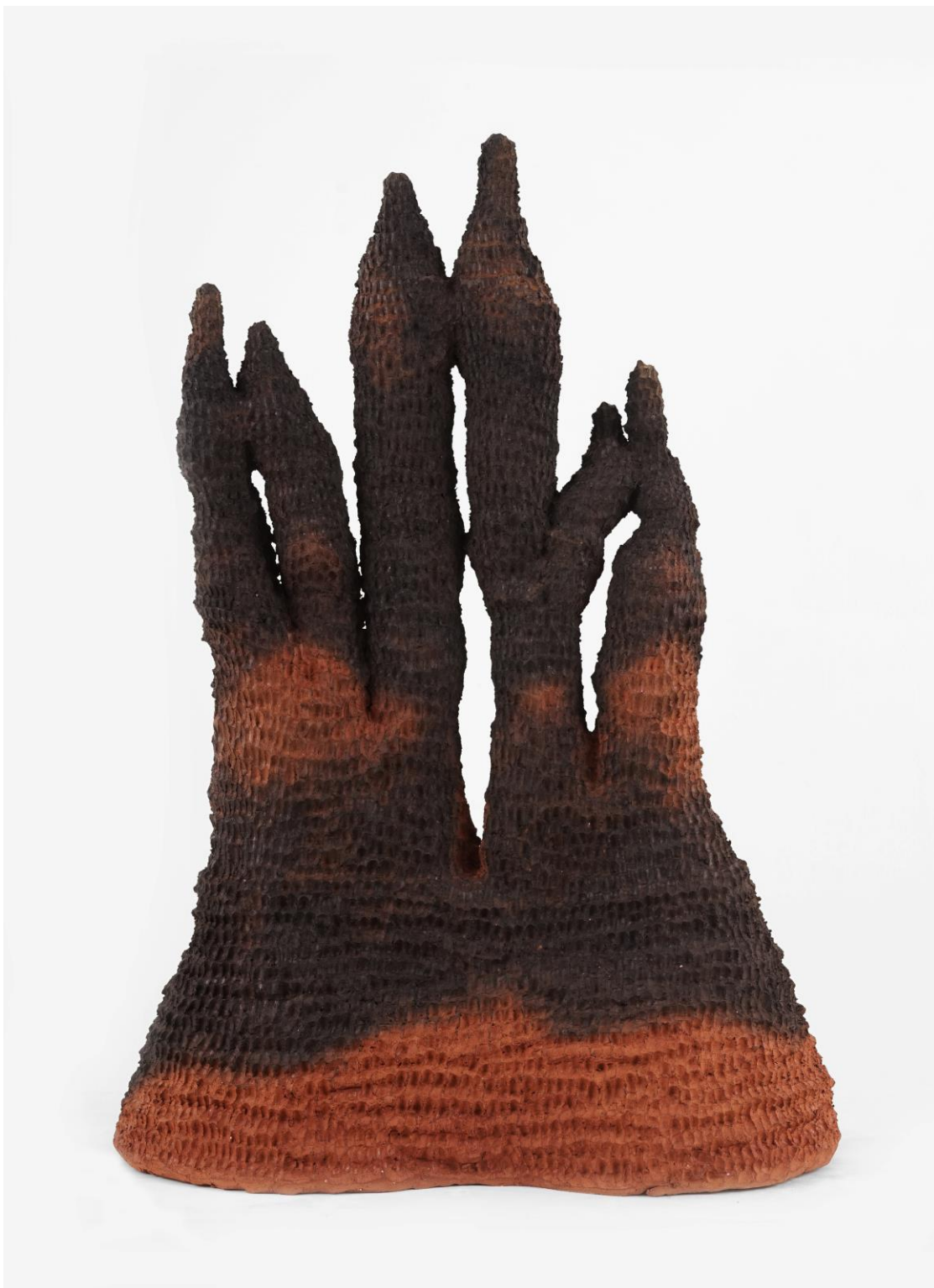
A Mountain - 一座山, 2019 Earthenware, 70 x 45 x 100 cm